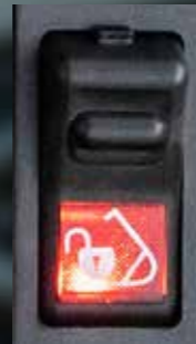
Safety Switch (backhoe)