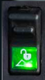
Safety Switch (loader)

Disables the control lever of loader, backhoe (excavator), and stabilizer levers by flipping the safety switch on the side console